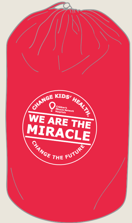
OPTION 3 Branded nylon travel bag